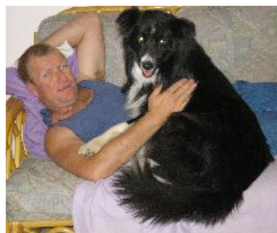
I think I'd make a good therapy dog!

That's all for now, Wove from Bullet....across the ditch.