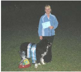
Me with my new Mum & my first Oz Obedience Prizes

Saturday night 3/11/07 - Mum had entered me in a CCD and she did not tell a sole over here. We were on fire, the judge said all the way through "just beautiful, don't look at the dog look straight ahead, don't look at him". Then Mum looked like a nobby dog. Bad mum for taking her eyes off me. Can you believe that we lost 1 point for Mum looking at me and I lost the other point, I was a bit off centre in my sit on the recall. This test was marked out of 100 Mum and I got 98 out of 100 not bad. Oh yeah, AND we WON!!!